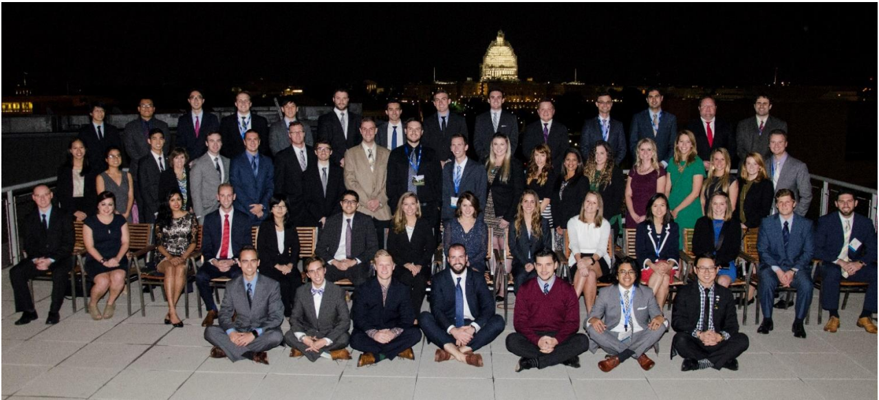
The 2015 U.S. American Dental Association/ DENTSPLY Student Clinicians.

DENTSPLY International assembled the 56 th Annual American Dental Association (ADA)/DENTSPLY Student Clinician Research Award Program and Reception on November 7, 2015. The awards program took place in Washington, D.C. at The Newseum, during the 2015 ADA Annual Session. Seventy student clinicians participated in this year's program, representing research conducted across 39 countries.